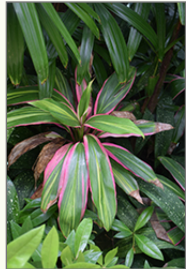
Kiwi Hawaiian Ti Plant

Kiwi Hawaiian Ti Plant is recommended for the following landscape applications;