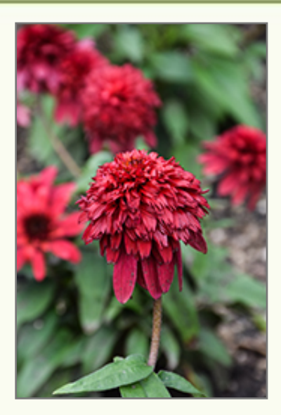
Double Scoop Strawberry Deluxe Coneflower flowers

Large, fully double blooms of strawberry red, on strong stemmed, well branched plants with improved flower count; more reliable first year flowering; attracts pollinators and feeds the birds in winter; use in naturalized areas with other native plants