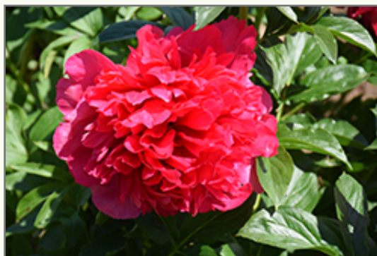
Command Performance Peony flowers