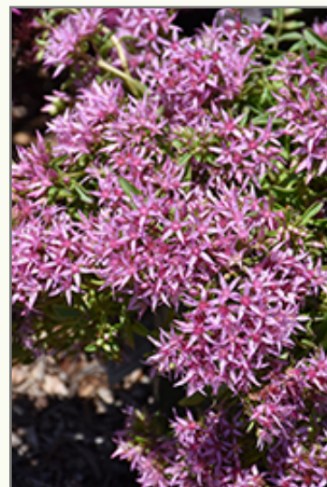
Spot On Pink Stonecrop flowers

Spot On Pink Stonecrop is a dense herbaceous evergreen perennial with a ground-hugging habit of growth. It brings an extremely fine and delicate texture to the garden composition and should be used to full effect.