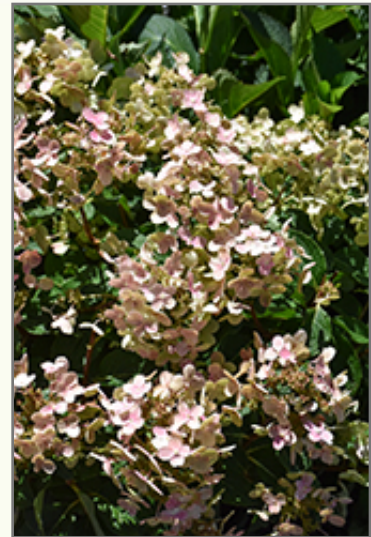
Early Evolution Hydrangea flowers

Early Evolution Hydrangea is recommended for the following landscape applications;