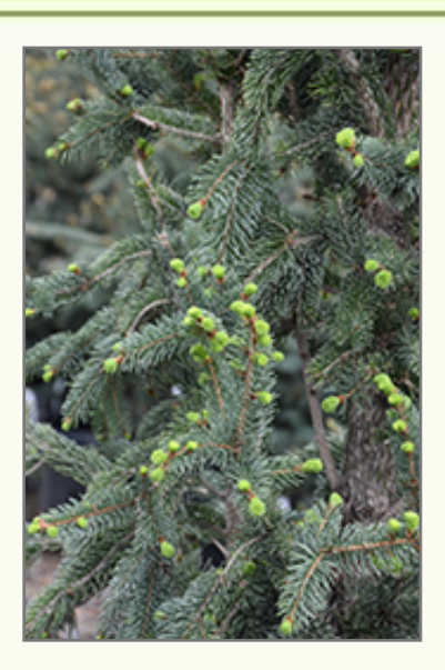
Wellspire Black Spruce foliage

Wellspire Black Spruce is recommended for the following landscape applications;