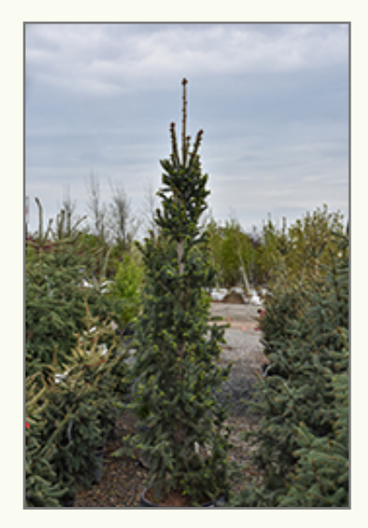
Wellspire Black Spruce