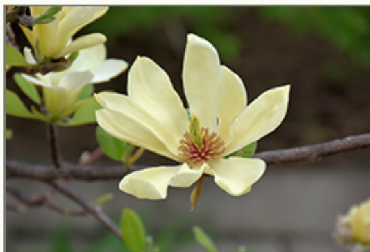
Butterflies Magnolia flowers