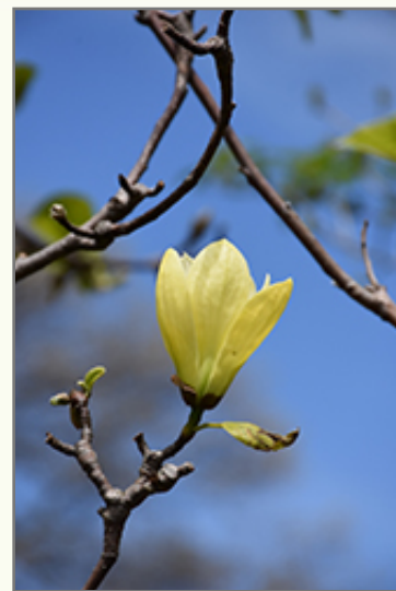
Butterflies Magnolia flowers