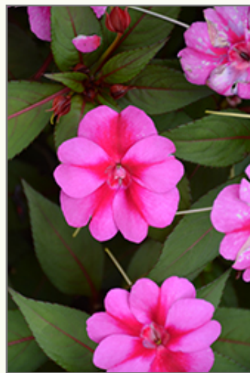
SunPatiens Compact Purple Candy Impatiens flowers

SunPatiens Compact Purple Candy Impatiens is a dense herbaceous annual with a mounded form. Its medium texture blends into the garden, but can always be balanced by a couple of finer or coarser plants for an effective composition.