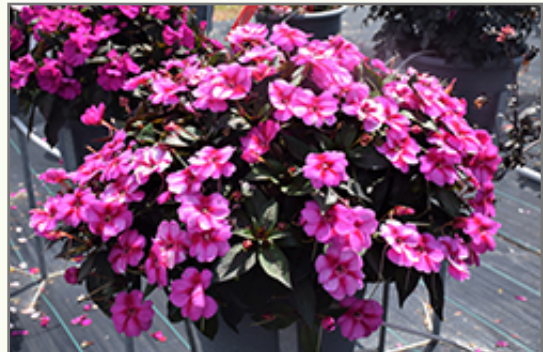
SunPatiens Compact Purple Candy Impatiens in bloom