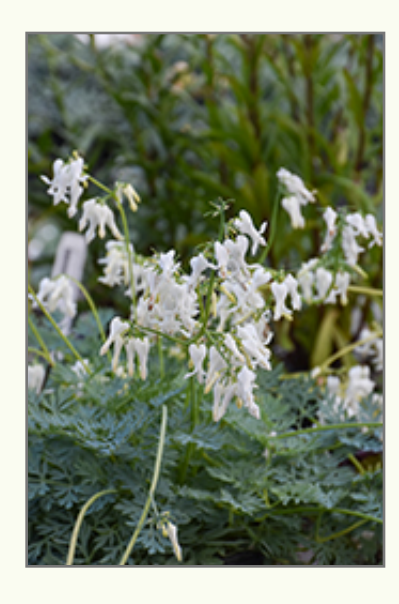
Amore Titanium Bleeding Heart flowers