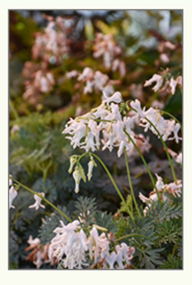
Amore Titanium Bleeding Heart flowers

This plant will require occasional maintenance and upkeep, and should be cut back in late fall in preparation for winter. It is a good choice for attracting butterflies to your yard, but is not particularly attractive to deer who tend to leave it alone in favor of tastier treats. It has no significant negative characteristics.