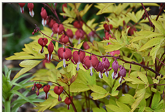
Ruby Gold Bleeding Heart flowers

This plant will require occasional maintenance and upkeep, and should be cut back in late fall in preparation for winter. It is a good choice for attracting butterflies and hummingbirds to your yard, but is not particularly attractive to deer who tend to leave it alone in favor of tastier treats. It has no significant negative characteristics.