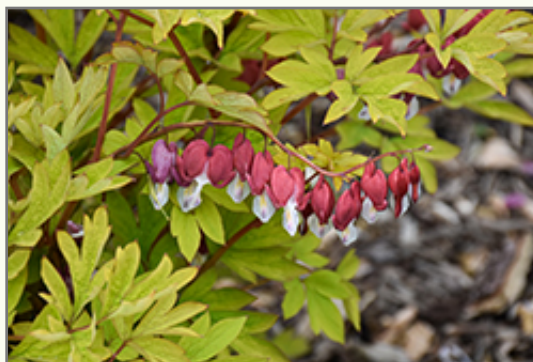
Ruby Gold Bleeding Heart flowers