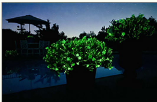
Firefly Petunia flowers

This is a relatively low maintenance plant. Trim off the flower heads after they fade and die to encourage more blooms late into the season. Deer don't particularly care for this plant and will usually leave it alone in favor of tastier treats. It has no significant negative characteristics.