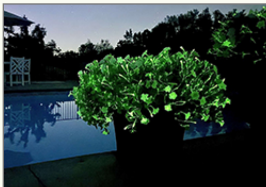
Firefly Petunia flowers