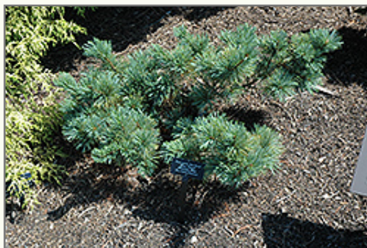
Blue Dwarf Japanese Stone Pine

This is a high maintenance shrub that will require regular care and upkeep. When pruning is necessary, it is recommended to only trim back the new growth of the current season, other than to remove any dieback. It has no significant negative characteristics.