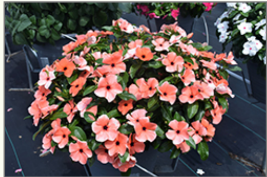
Tattoo Orange Vinca in bloom