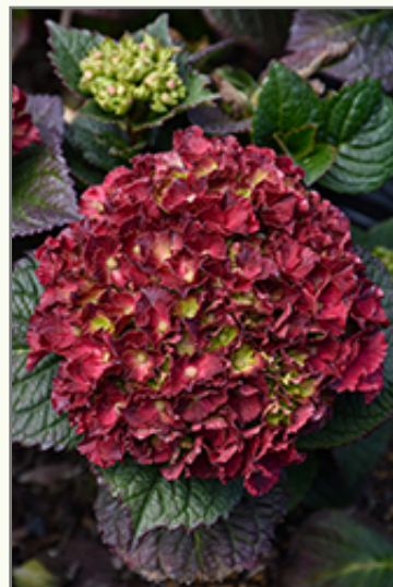
Cherry-Go-Round Hydrangea flowers