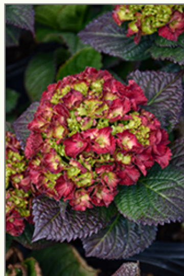
Cherry-Go-Round Hydrangea flowers

Cherry-Go-Round Hydrangea is recommended for the following landscape applications;