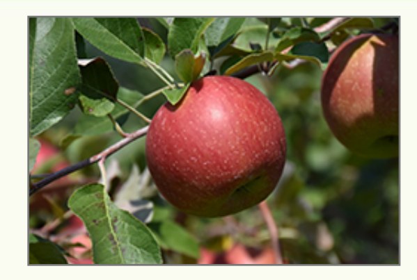
WineCrisp Apple fruit