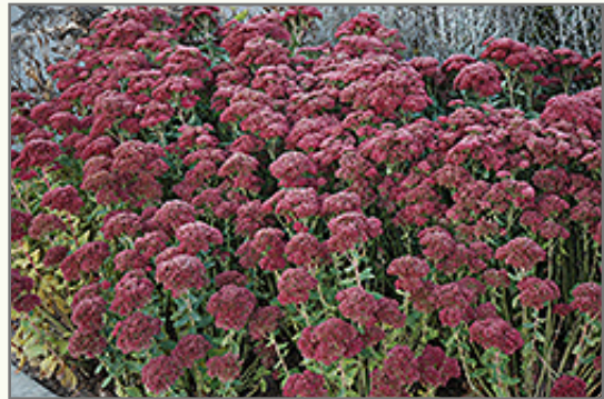
Autumn Fire Sedum in bloom