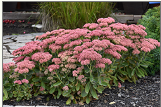
Autumn Fire Sedum in bloom