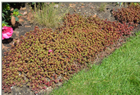
Fireglow Sedum