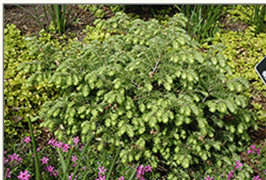
Moon Frost Canadian Hemlock

This shrub will require occasional maintenance and upkeep, and is best pruned in late winter once the threat of extreme cold has passed. Gardeners should be aware of the following characteristic(s) that may warrant special consideration;