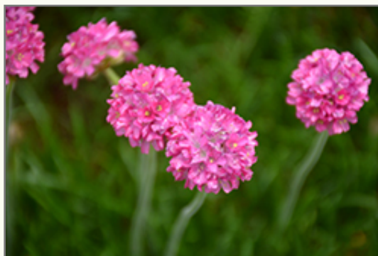
Bloodstone Sea Thrift flowers