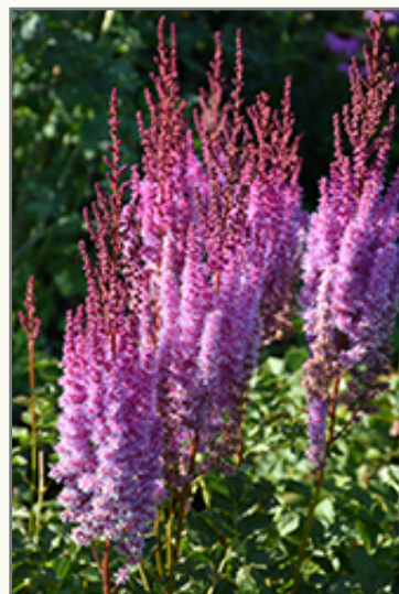
Superba Astilbe flowers

Superba Astilbe is recommended for the following landscape applications;