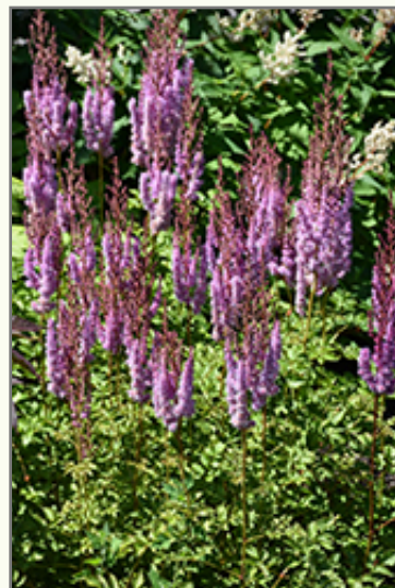
Superba Astilbe in bloom