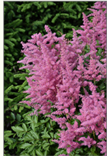
Vision in Pink Astilbe flowers

Vision in Pink Astilbe is recommended for the following landscape applications;