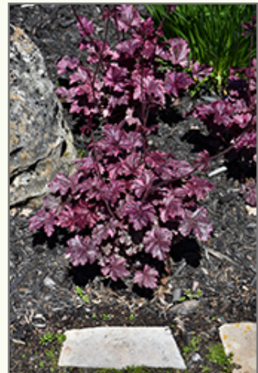
Midnight Rose Coral Bells