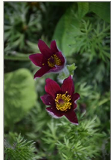
Red Pasque Flower flowers