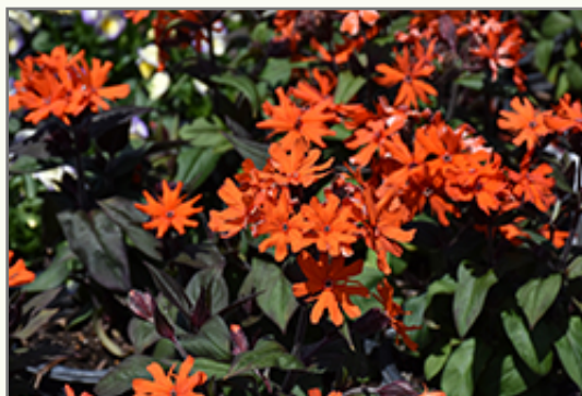
Orange Gnome Maltese Cross flowers

This is a relatively low maintenance plant, and is best cleaned up in early spring before it resumes active growth for the season. It is a good choice for attracting butterflies and hummingbirds to your yard. It has no significant negative characteristics.