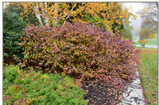
Red Twiggged Dogwood in fall