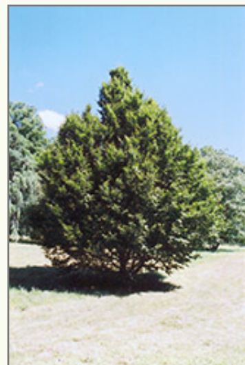
Blue Beech

This tree will require occasional maintenance and upkeep, and is best pruned in late winter once the threat of extreme cold has passed. It has no significant negative characteristics.