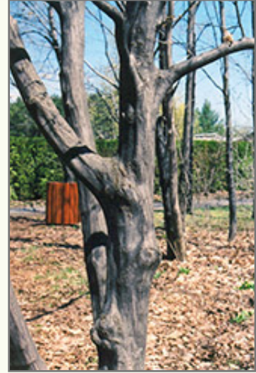
Blue Beech bark