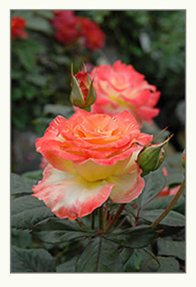
Chihuly® Floribunda Rose flowers