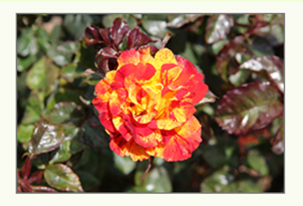
Chihuly® Floribunda Rose flowers

Chihuly® Floribunda Rose is a multi-stemmed deciduous shrub with an upright spreading habit of growth. Its average texture blends into the landscape, but can be balanced by one or two finer or coarser trees or shrubs for an effective composition.