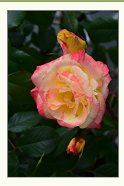
Chihuly® Floribunda Rose flowers