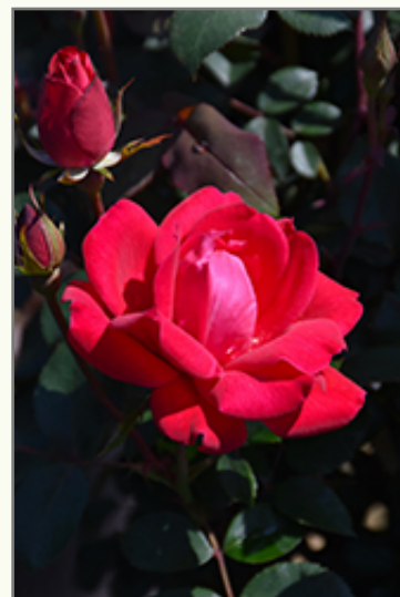
Double Knock Out® Shrub Rose flowers