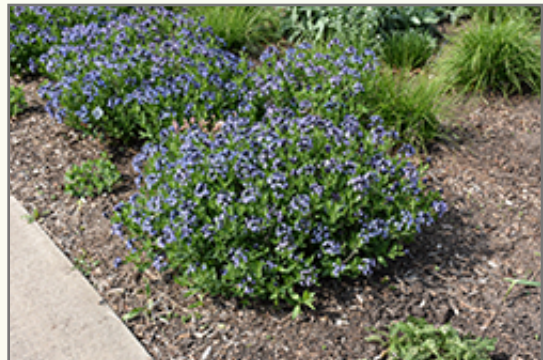
Blue Ice Blue Star in bloom