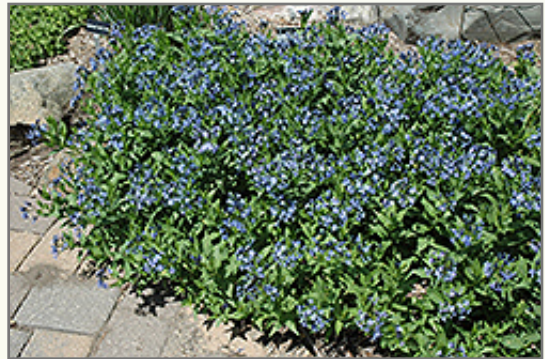
Blue Ice Blue Star in bloom