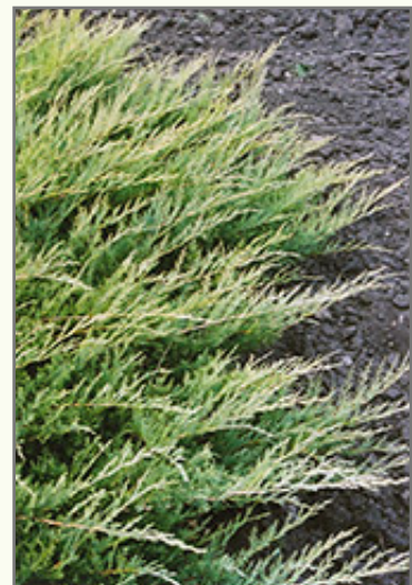
Broadmoor Juniper foliage