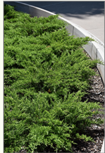
Broadmoor Juniper