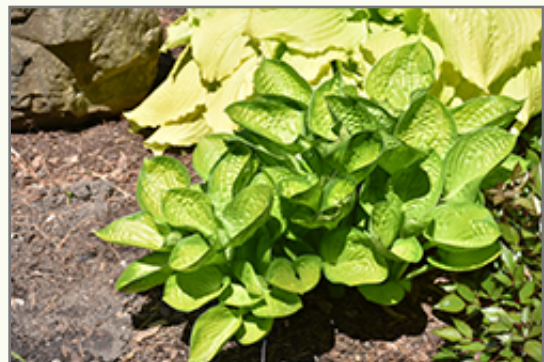
Rainforest Sunrise Hosta