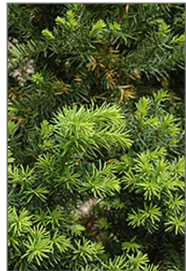
Hicks Yew foliage