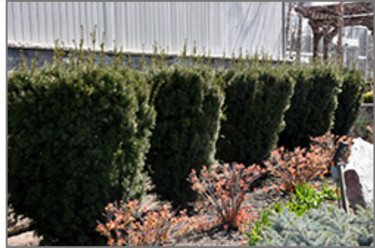
Hicks Yew

Hicks Yew will grow to be about 10 feet tall at maturity, with a spread of 3 feet. It has a low canopy with a typical clearance of 1 foot from the ground, and is suitable for planting under power lines. It grows at a slow rate, and under ideal conditions can be expected to live for 50 years or more.