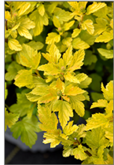
Tiny Wine Gold Ninebark foliage

Tiny Wine Gold Ninebark is recommended for the following landscape applications;