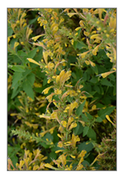
Kudos Yellow Hyssop flowers