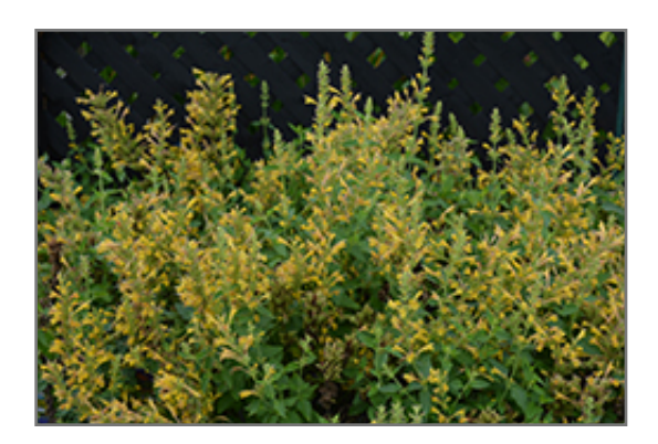
Kudos Yellow Hyssop flowers

Wasco Nursery & Garden Center 41W781 Route 64, St. Charles, IL, 60175 phone: 630.584.4424 www.wasconursery.com sales@wasconursery.com