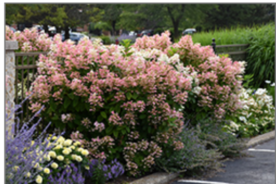
Quick Fire Hydrangea in bloom