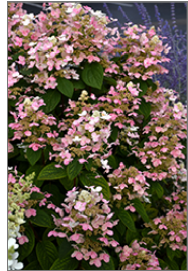
Quick Fire Hydrangea flowers