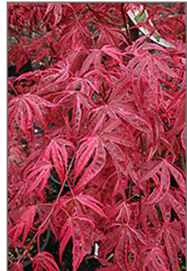
Shirazz Japanese Maple foliage